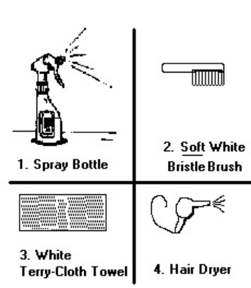
Figure 1 Simple Spotting Kit