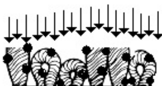
Figure 2 Soiled Fabric Being Pre-conditioned with High Pressure, Hot Water & Fitting Detergent