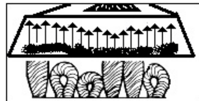
Figure 4 Our Extraction uses Rinse with Encapsulation, Extra Dry Passes Our Wand has a Window for visibility!